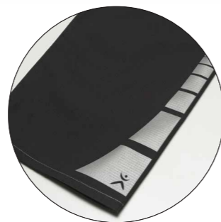
Motive „Square“ Product no. 9901402 Measurements: approx. 25 x 7,5 cm