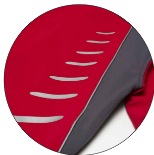
Motive „Brush“ Product no. 9901401 Measurements: approx. 25 x 9,5 cm

Bright transfer prints Whether you need a patch on the back, dungaree pocket, sleeves or trouser legs, we ensure that your logo looks brilliant.