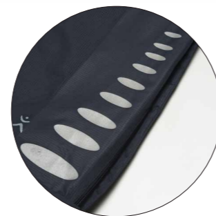
Motive „Bubble“ Product no. 9901403 Measurements: approx. 25 x 8,5 cm